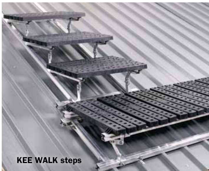
KEE WALK steps

Kee Safety provides pre-assembled step configurations in 3m or 1.5m lengths which require only minor adjustment on-site. The rotating arms (shown above) allow the installer to set the angle of the steps simply by removing the locating bolt, setting the horizontal angle and then replacing the bolt. The steps configurations will change depending on the pitch of the roof. Standard components are available for 5° - 10°, 10° - 15°, 15° - 25°, 25° - 35°, all which comply with the requirements of EN 516. Kee Safety can provide specific information on all the different step configurations as required.